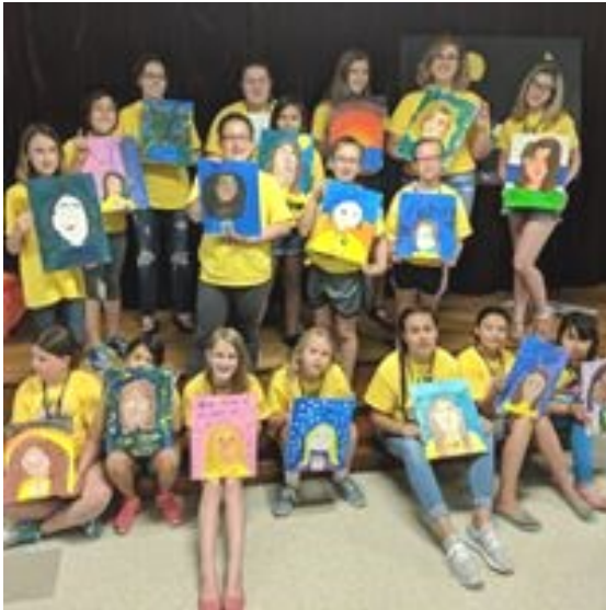
Left picture: 2018 Strong Girls 2 Women participants pose with their self-portraits.